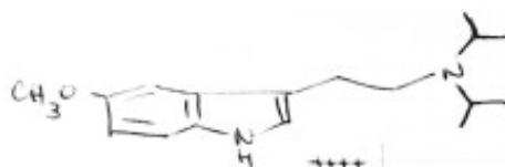
5-OCH 3 -DIPT